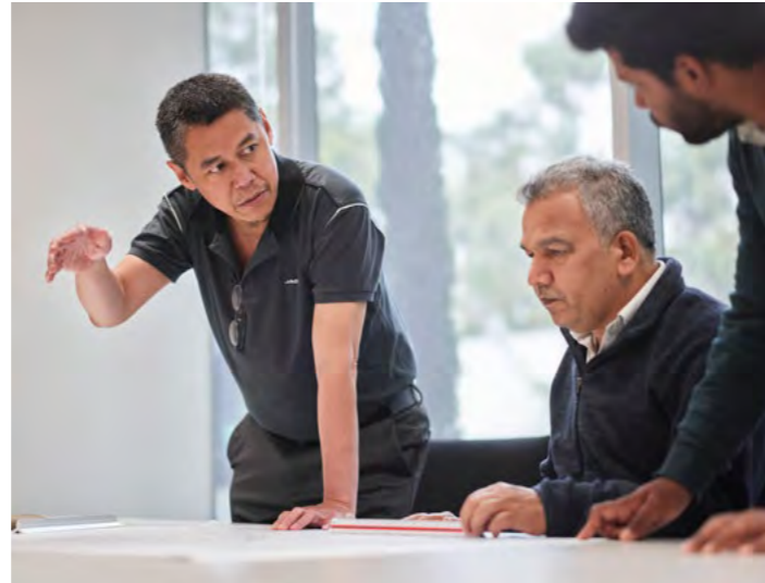
— Scheduling and Estimating team members working at the Truganina office.

Our advanced technology solutions help mitigate risk, preventing small problems from becoming critical on-site issues, adding further cost savings to your project.