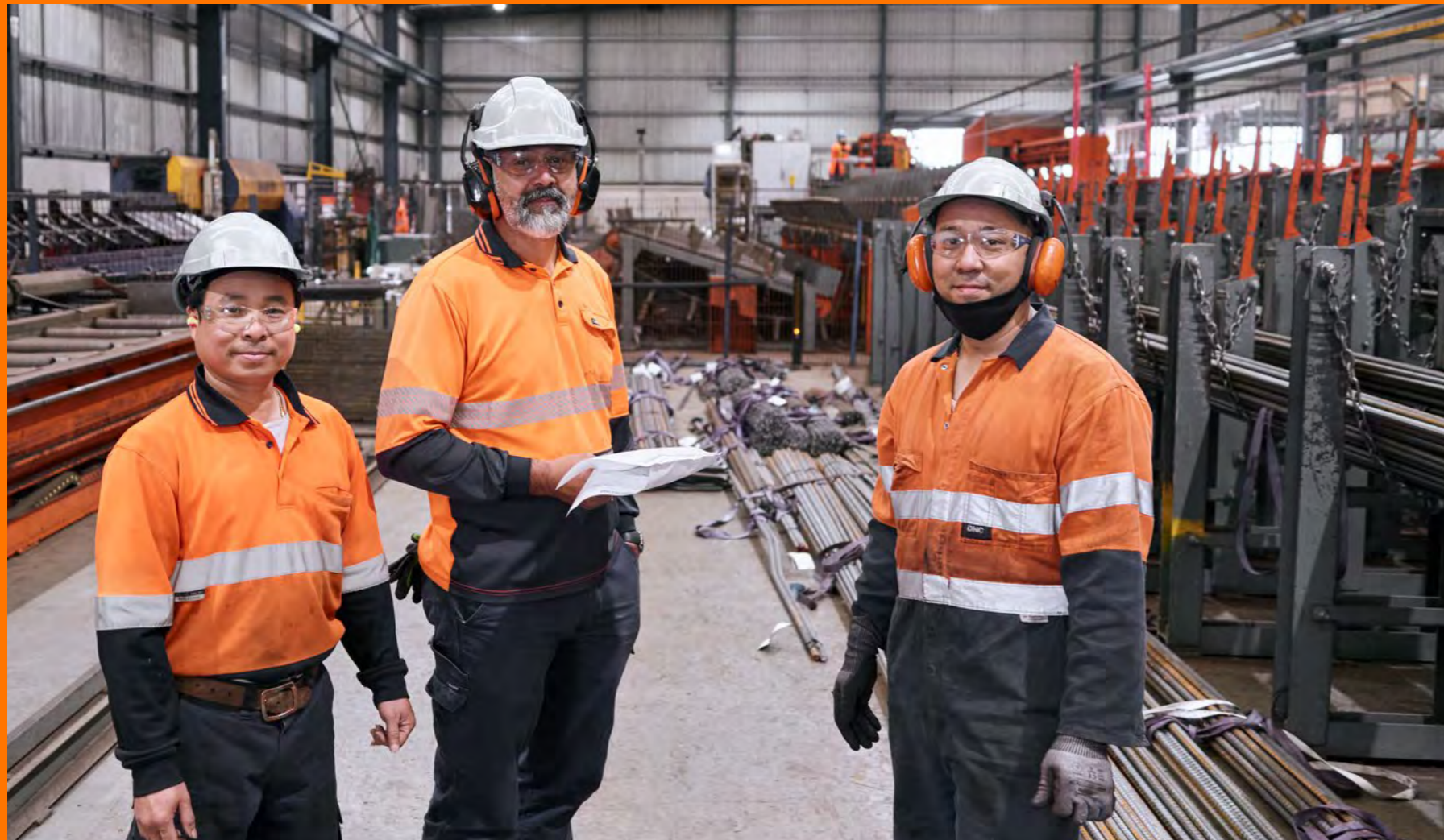
— Factory team members in the Truganina facility, Melbourne.

Our strong belief in ‘family culture’ allows us to build lasting relationships based on trust and integrity with sub-contractors, employees and clients.