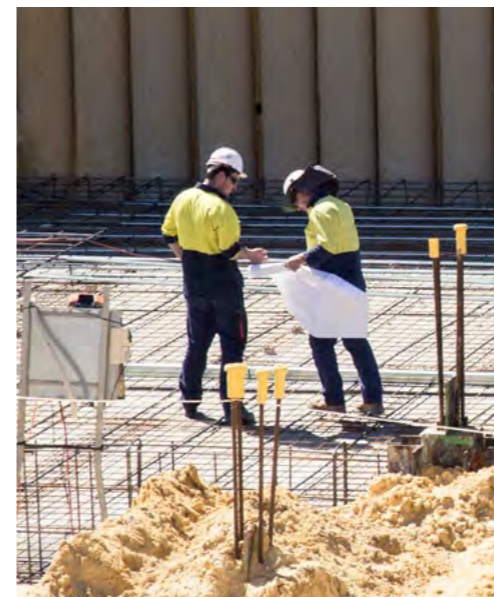
Two workers reviewing the construction drawings at the 500 Hay Street development, Subiaco WA.

OUR CUSTOMERS KNOW THAT IF WE SAY WE'RE GOING TO DO SOMETHING, WE DO IT.