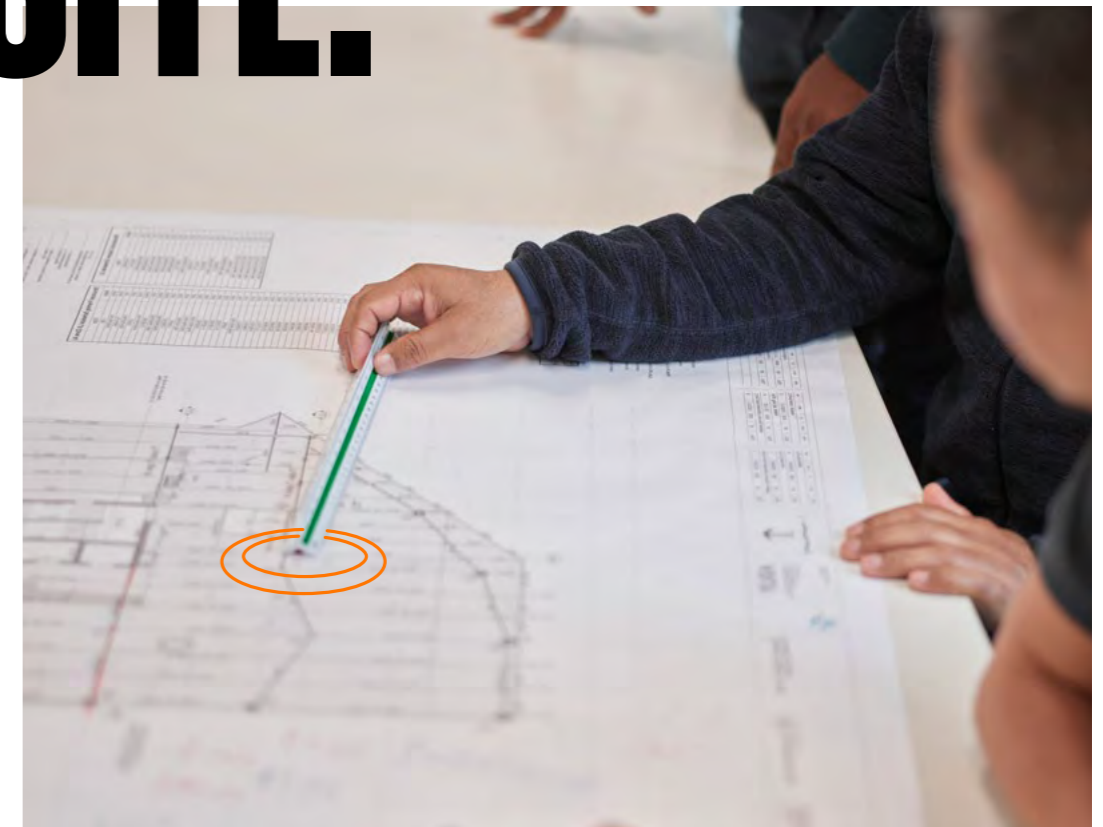
— Scheduling and Estimating team members working from construction drawings at the Truganina office.

SEE THE PROBLEM BEFORE IT'S A PROBLEM ON-SITE.