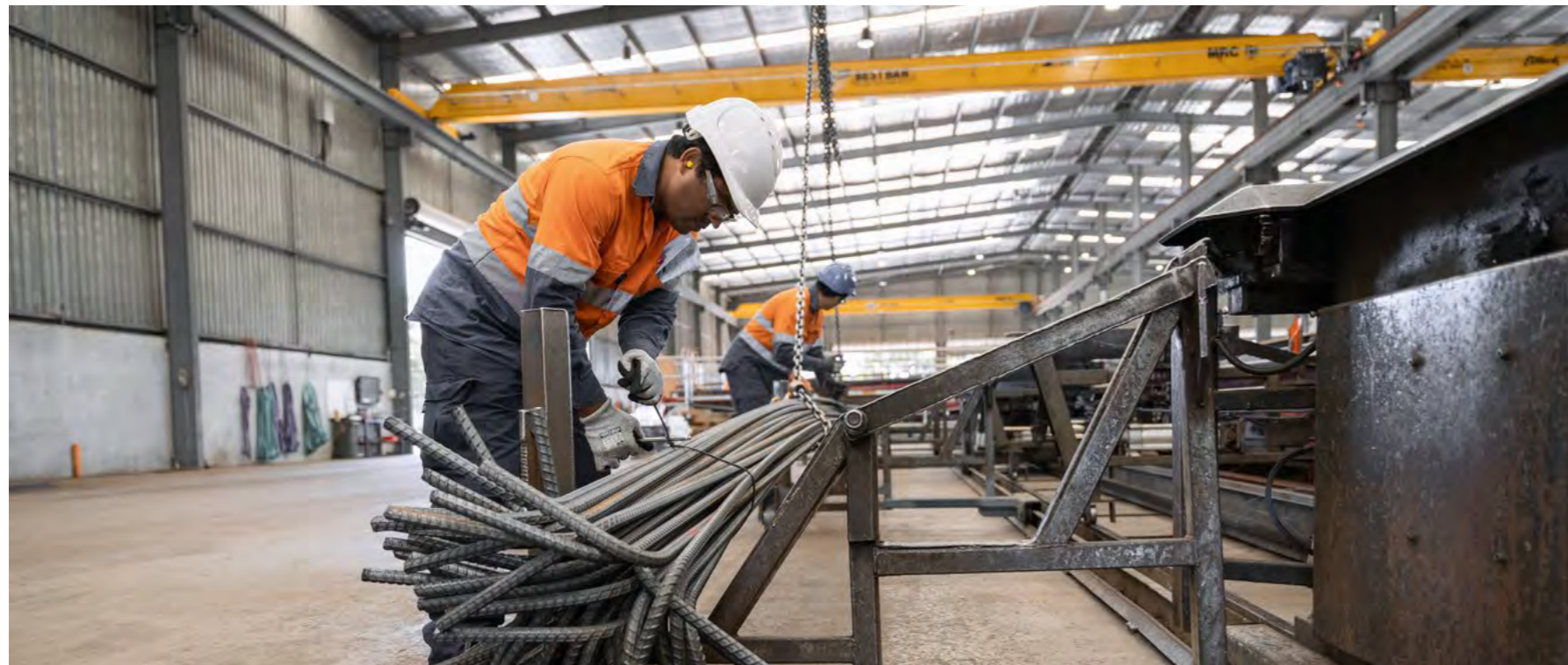
Machine operators tying a new bundle of cut and bent rebar in the East Rockingham facility, WA.

REDUCTION IN AIFR ROLLING AVERAGE SINCE 2018