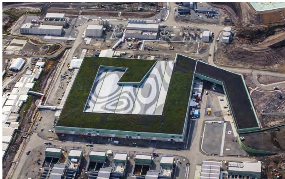
Victorian desalination project in December 2014