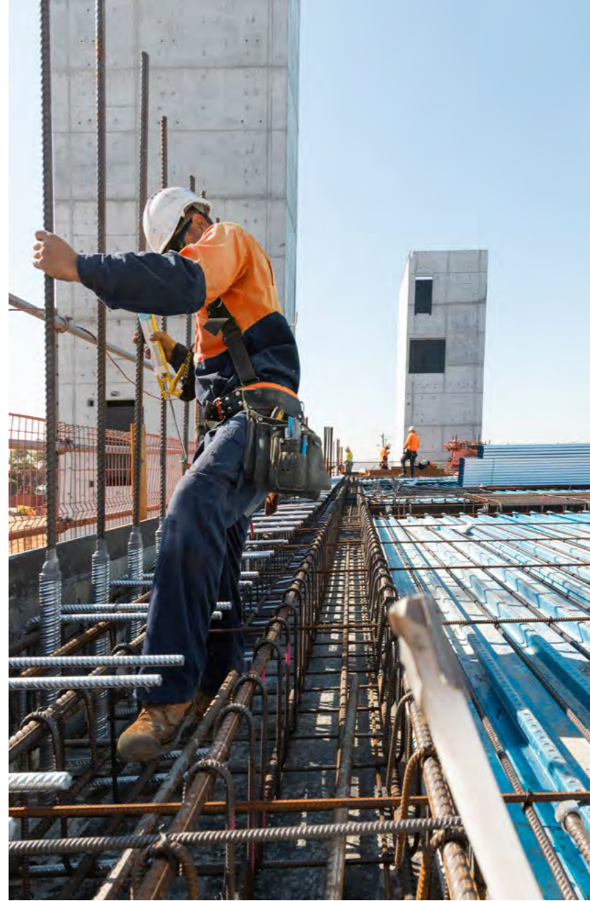
Steel fixer tying rebar at the Karrinyup Shopping Centre in May 2019. Project by Multiplex.

Our workforce demonstrates the ability to deliver large and complex infrastructure projects across Australia.